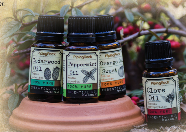
Holidays are Here Again!